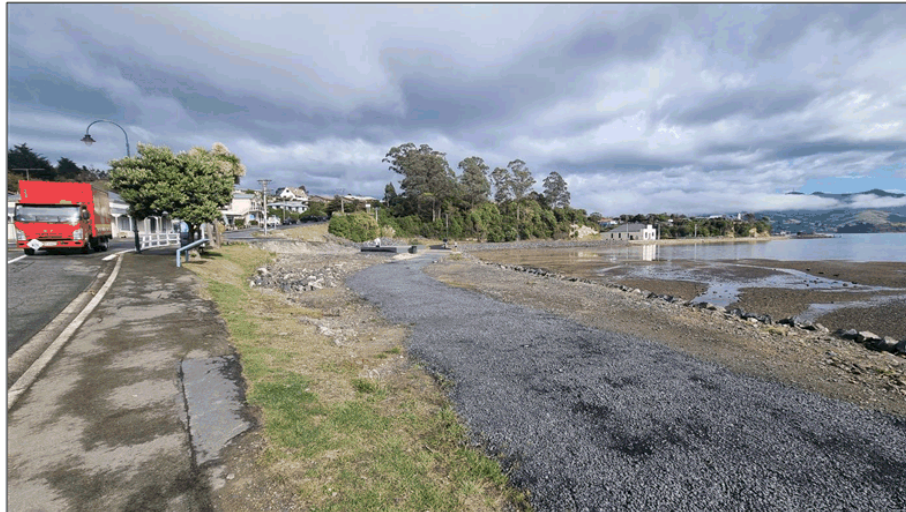
Figure 1 Portobello township has languished with unfinished an unkempt piece of reclamation for nearly a year. It has been confusing for locals and visitors alike with little or no communication on when this eyesore will be completed.