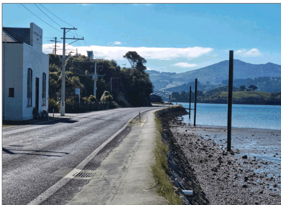
Figure 2 – The now famous but flawed poles placed in Latham Bay as a trial for the boardwalk. If the Council and its Consultants were never going to build a boardwalk, why would you use precious resources on a trial?

the media, but was raised in the 24th March 2022 Community Board Meeting by its Consultant was that there was a $2 million shortfall for the boardwalk. For the Council to lay the blame on the Community for this failure is completely unacceptable and untrue. In a further example of how strange and convoluted the contract management process has been for this section, the Council's Consultants undertook a trial of poles for the planned boardwalk in December 2021. There was no explanation of what they were doing or why, but it clearly indicated that a boardwalk was going to be built as part of the Portobello section of the Connection Project.