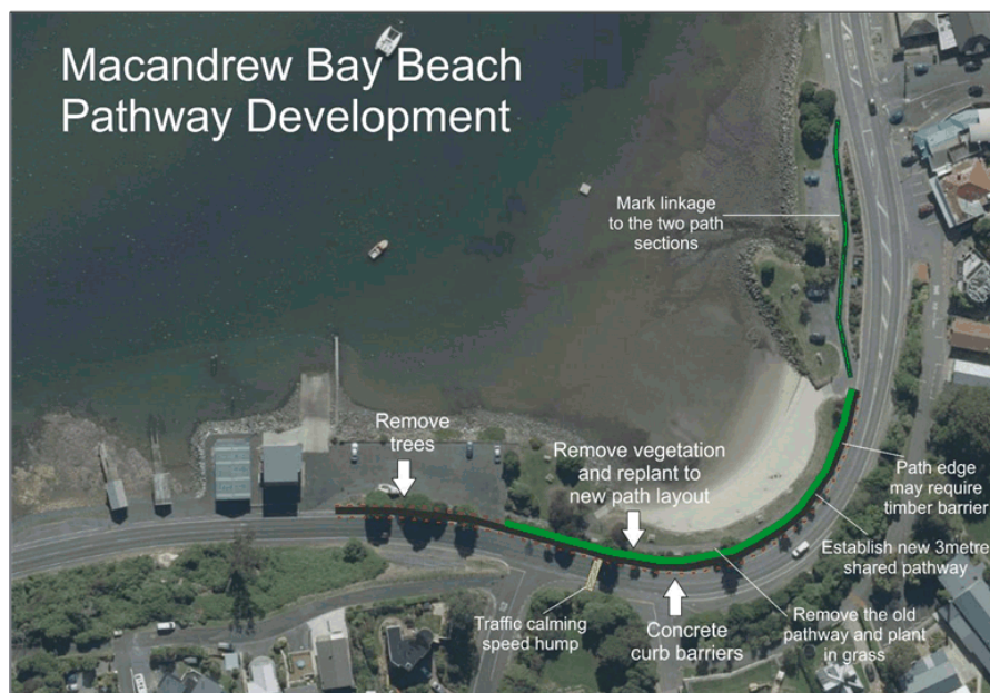
Figure 4 – Macandrew Bay has become a dangerous bottleneck between the two sections of the Peninsula Connection Project and safety issues need to be addressed.