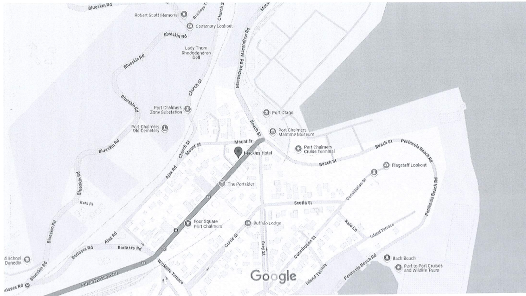
Map data ©2025 Google 50 m