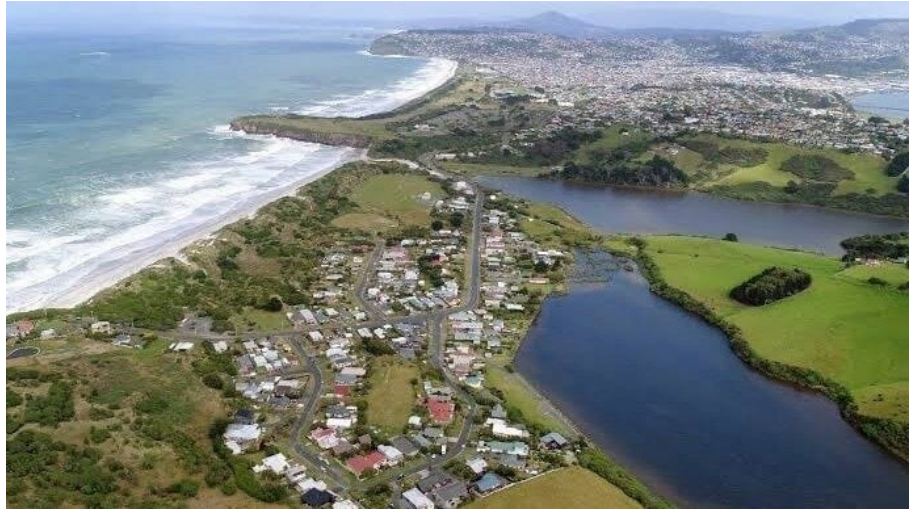
5. Tomahawk School Landscaping. For more than a decade the Tomahawk has patiently waited for resolution to this area. The City Council purchased this property for "Coastal Protection" but there has been no plan or undertaking to integrate the site into the community or landscape context. This site, once bustling with activity and laughter, has been left in an unfinished state that does not reflect the beauty or spirit of the Tomahawk community.

There is an expectation from the community that the commitment to complete the entire Portobello/Harington Pt Rd Safety Improvement Project, aka the Peninsula Connection, will be honoured by Dunedin City Council as a priority and to the agreed design.