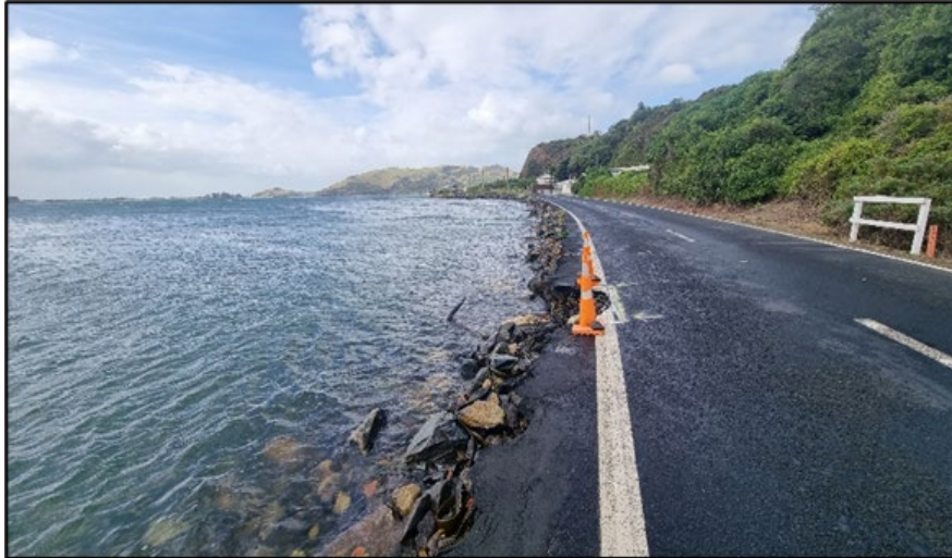
Figure 1 – An example of the undermining of the road because of the failing sea wall further narrowing the road.